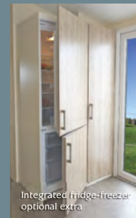
Integrated fridge-freezer optional extra

Designed to appeal to the entire family and characterised by its large feature panoramic windows, the all-new Calypso echoes the great outdoors with a family focused interior with plenty of space for all. Striking wood colours and vibrant contrasting contemporary fabrics to both seating and curtains combine to create a truly modern lifestyle holiday environment throughout this appealing new holiday home.