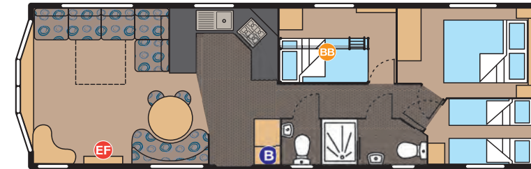
CALYPSO 37 x 12 - 3 Bedroom Sleeps 8 with sofa bed