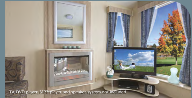
TV, DVD player, MP3 player and speaker system not included