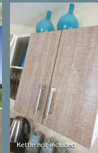
Kettle not included