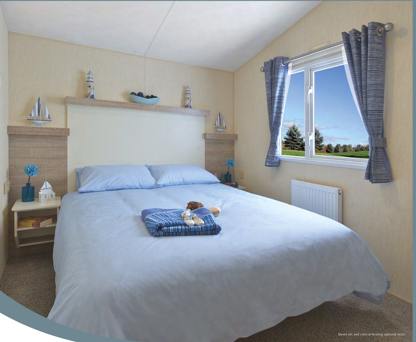
Duvet set and central heating optional extra