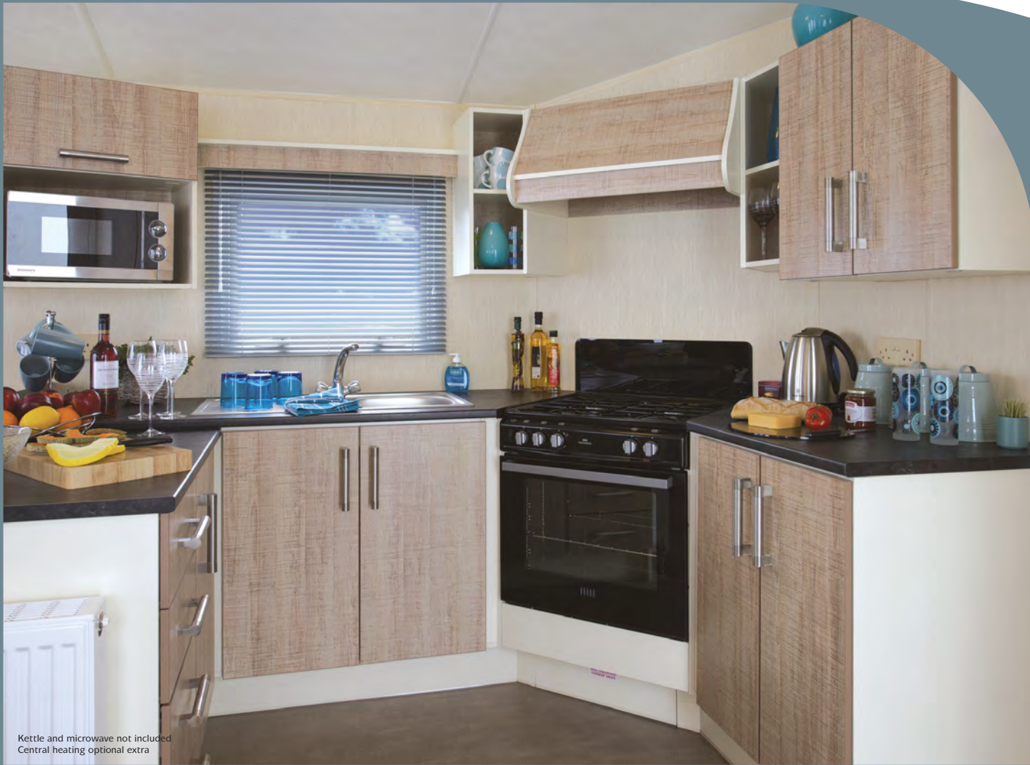
Kettle and microwave not included Central heating optional extra