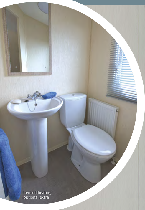
Central heating optional extra